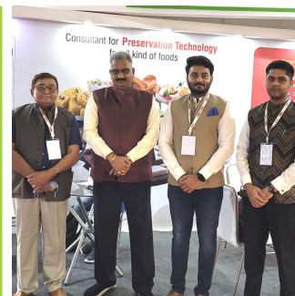
With Shri Vivekji & Shri Ayushji (Bikaner Elite - Patna)